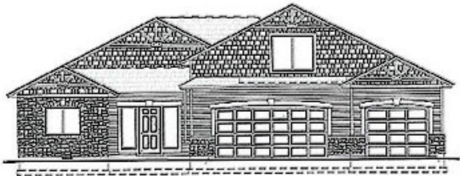
FRONT BUILDING ELEVATION SCALE: 1/4" = 1'-0"